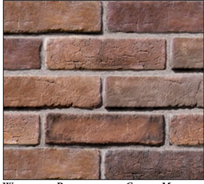
WEATHERED BRICK COLOR: CARMEL MOUNTAIN